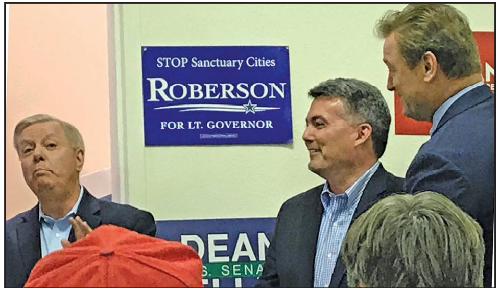
Senators Lindsey Graham, left, and Cory Gardner traveled to Nevada to rally with Senator Dean Heller in October.

The ads emphasized the importance of voting, and voting the straight Republican ticket for all offices in Nevada. Individual candidates were not mentioned; this was strictly a GOTV campaign for all GOP candidates running in Nevada. The NvFRW voted to support a NO VOTE on Question 5, which would allow the DMV to automatically register people to vote unless they choose to Opt Out in writing. The ads also stated that