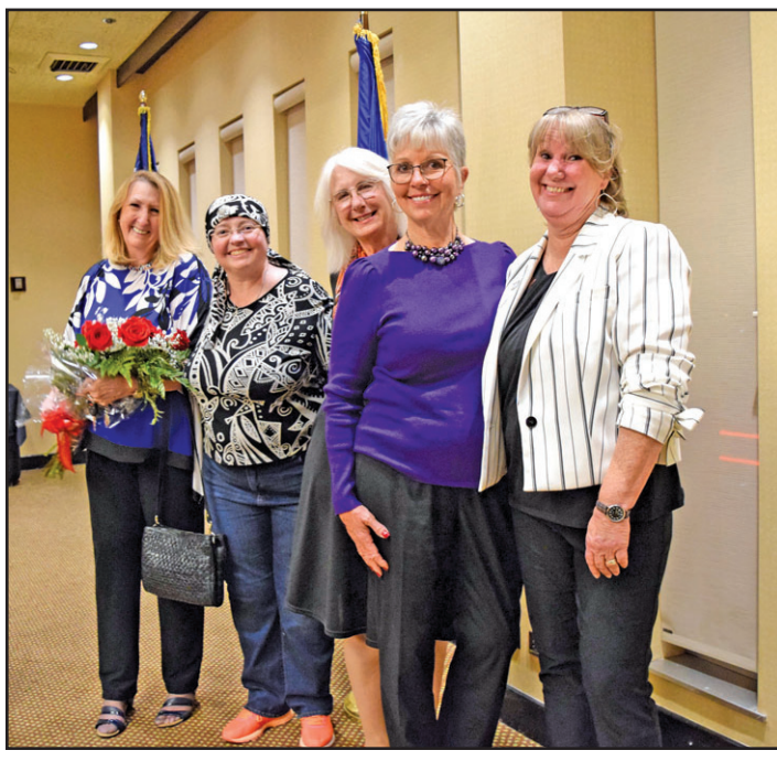
Leadership – Past, present, future

"Money isn't the problem. They did this because they want to break the constitution. Why? If they win on this, the legal opinion they got our own Legislative Counsel Bureau